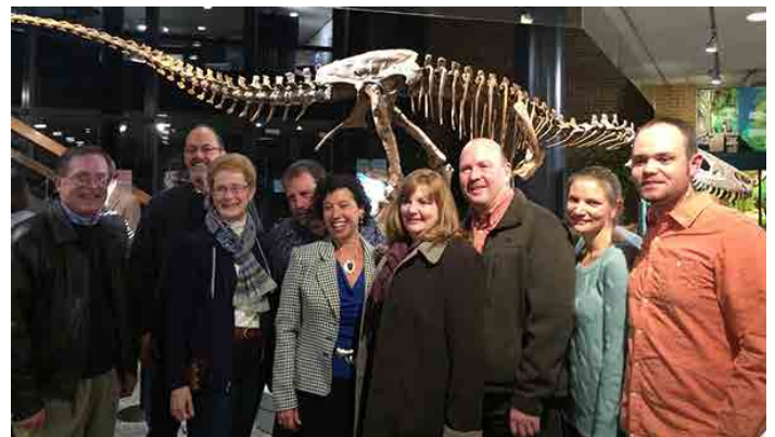
Night at the Museum. A group of SSC members gathered in front of the dinosaur skeleton at the Cleveland Museum of Natural History. We heard a fascinating lecture about the 1920s Blossom Expedition.

Contact me with any questions or concerns about the clubhouse or basin at timmo@sbcglobal.net or call 419-656-5881.